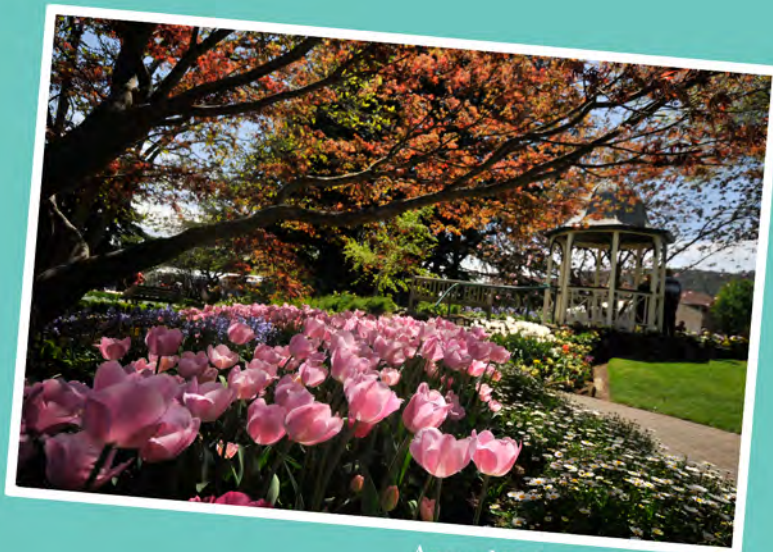
Annual Tulip Time Festival