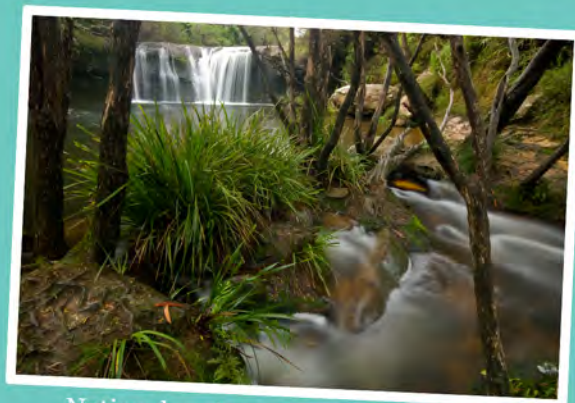
National parks and spectacular landscapes