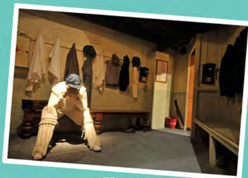
The Bradman Museum