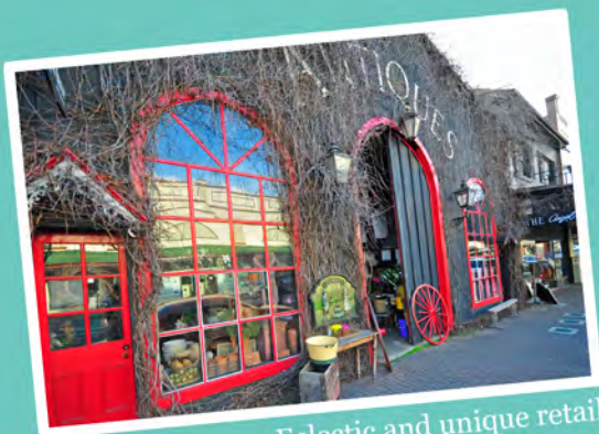
Eclectic and unique retail