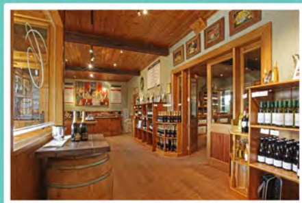
Food and wine