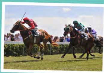
Bong Bong Races